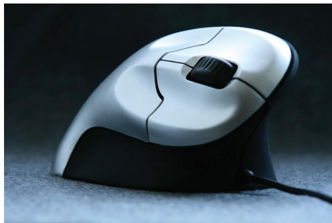
Figure 1: A Wow-pen mouse