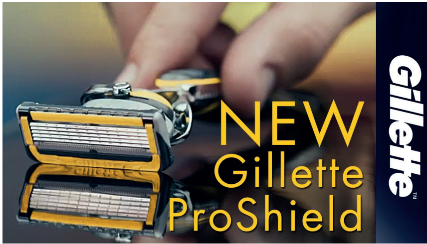
Figure 9: An example of a Gillette product