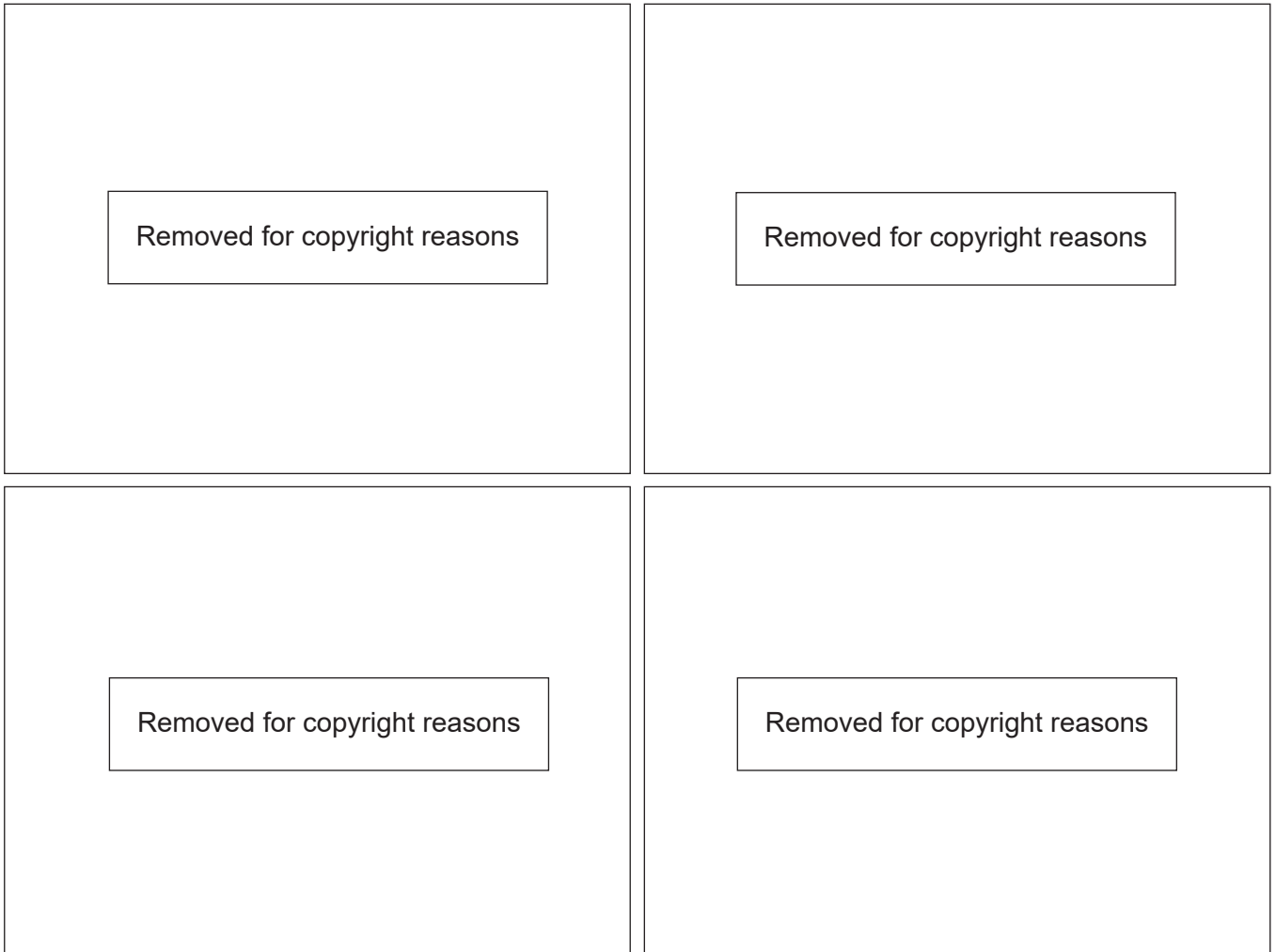
Figure 12: The evolution of the iPhone

How has each model of the iPhone best exemplified a product family?