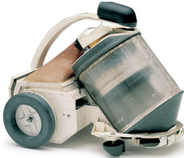
Figure 5: A Dyson vacuum cleaner