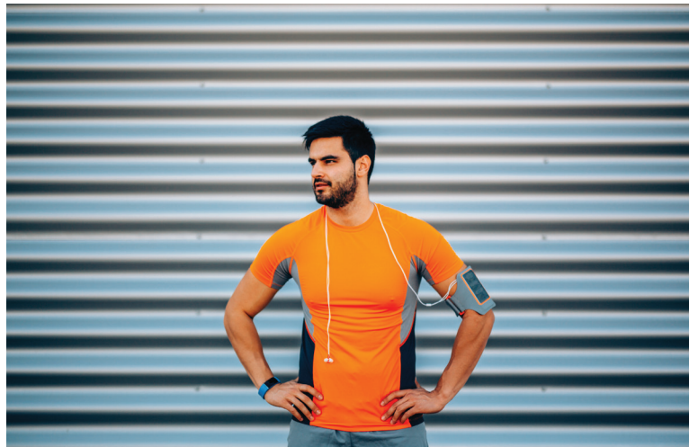
Figure 7: Modern sportswear

15. Modern sportswear often advertises its technical capabilities, such as wicking properties, see Figure 7 .