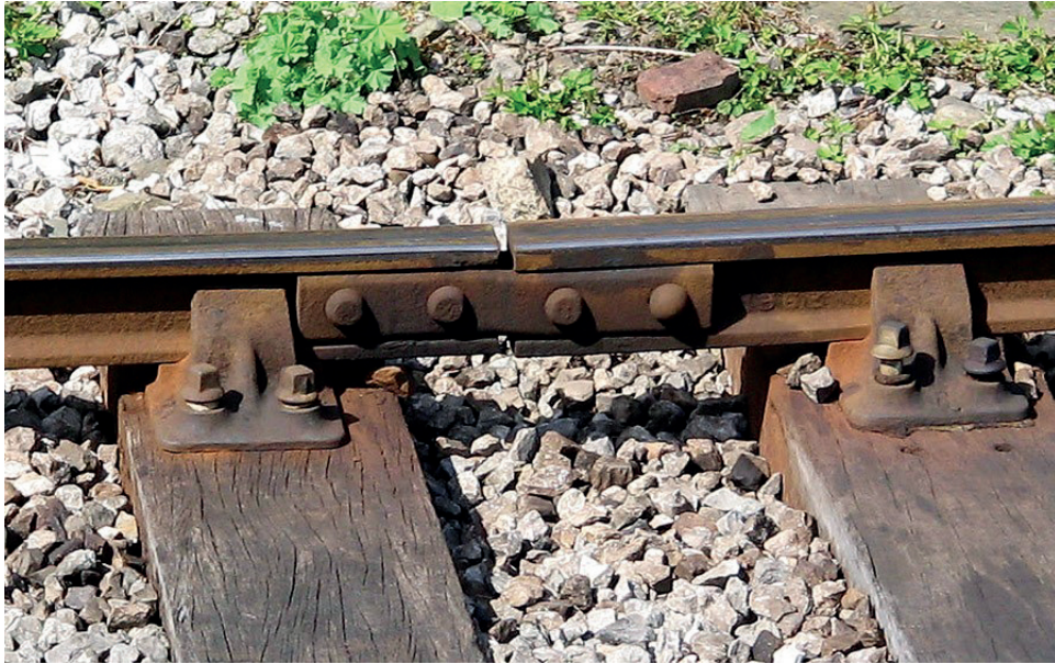
Figure 6: The gaps along railway tracks