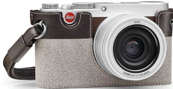
Figure 11: The Leica X digital camera