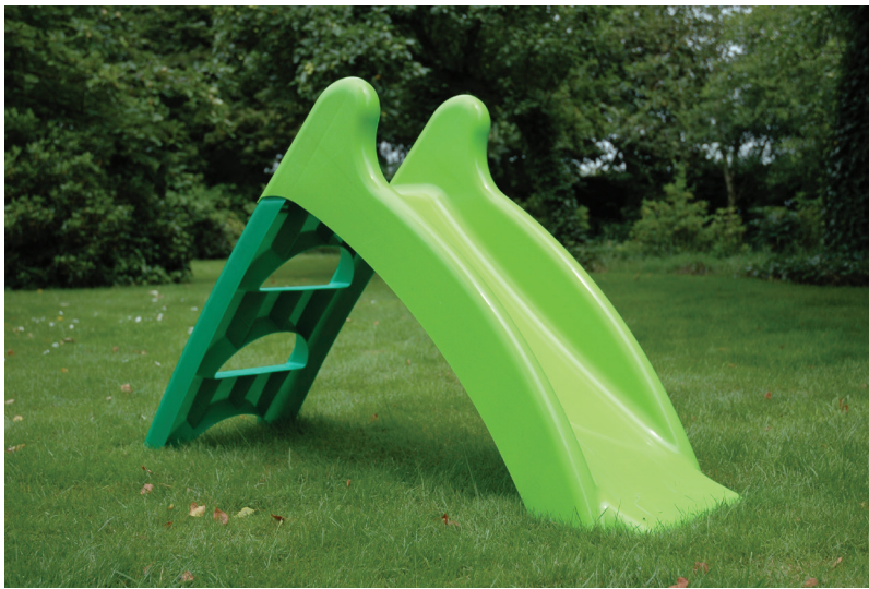
Figure 8: A child's garden slide