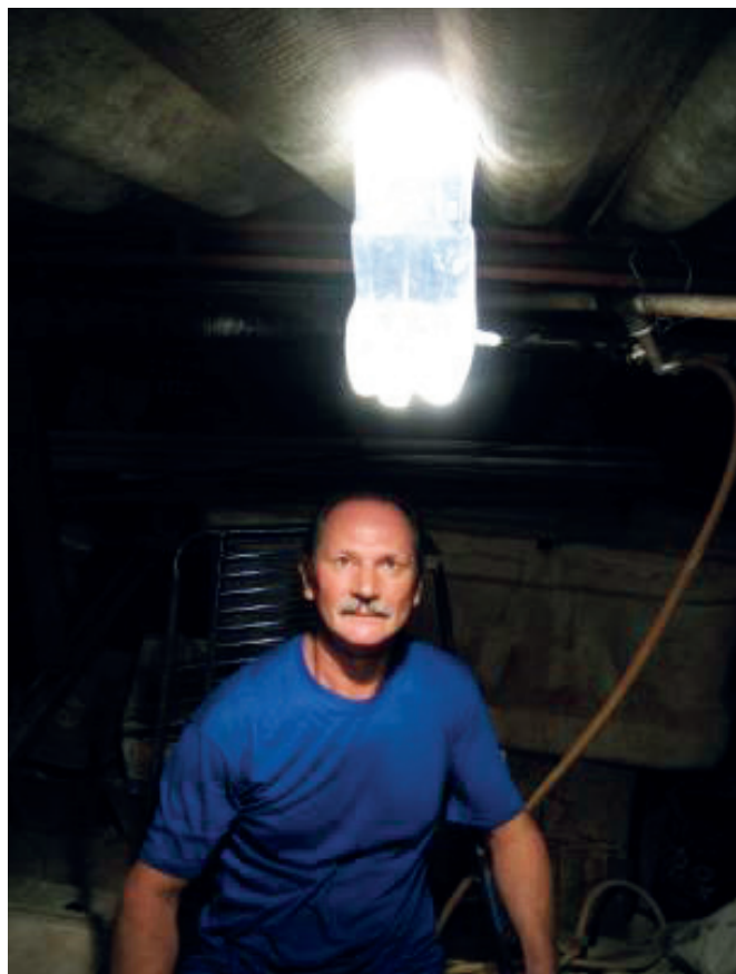
Figure 2: The Moser lamp