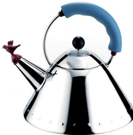
Figure 15: The bird whistle on the Alessi kettle