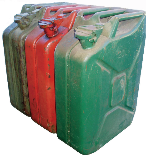
Figure 10: The Jerrycan