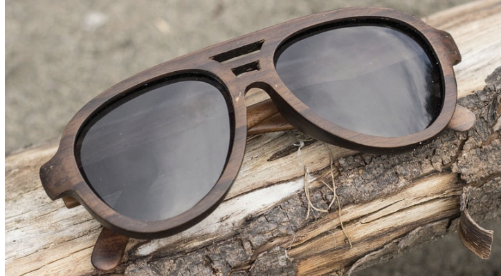
Figure 3: CoolBins Eyewear wooden sunglasses

What strategy is CoolBins Eyewear employing?